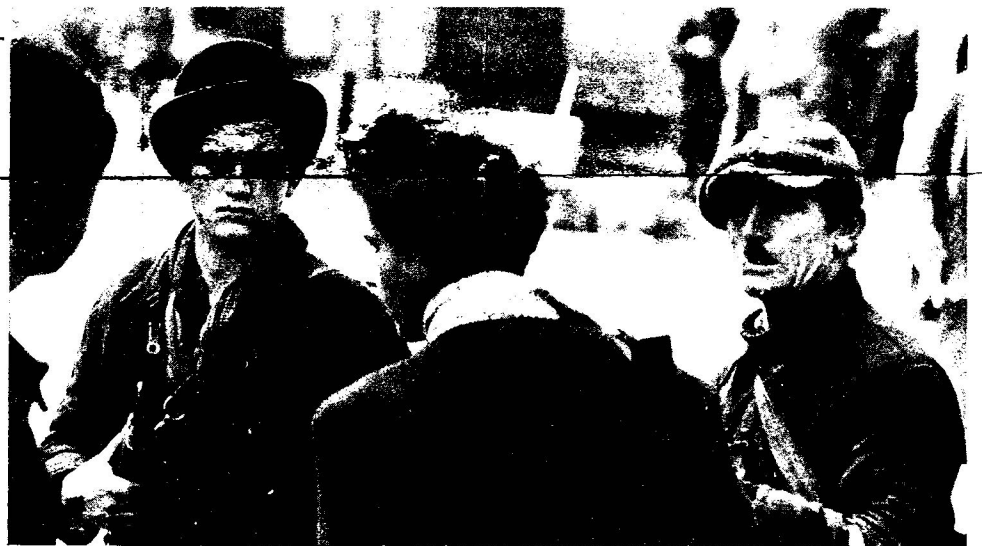
MILITANTS OF 1956 HUNGARIAN WORKERS UPRISING